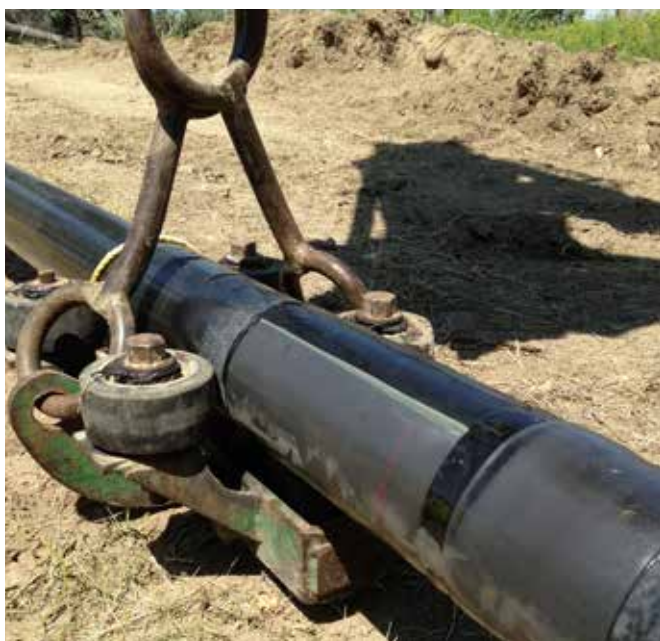
Figure 2. Canusa-CPS DDX™ Directional Drilling field joint coating system passing through rollers prior to entrance into the bore.

must also overlap and bond to the factory-applied coating on both sides to ensure consistent protection from moisture ingress along the entire length of the pipeline. Since the joint coatings are applied in the field, they must be designed while taking into consideration additional factors such as the local ambient conditions and terrain, impact on the application process, mainline coating type and thickness and contractor capabilities (equipment, personnel, etc.).