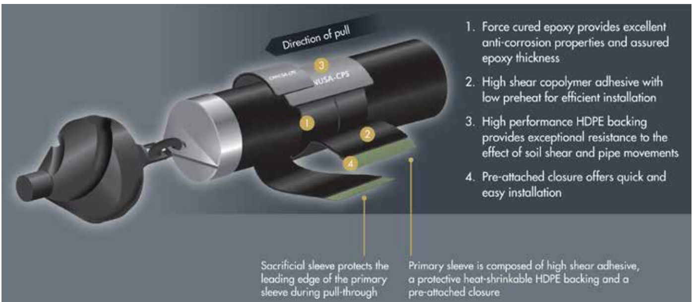
Figure 3. The Canusa-CPS DDX field-applied coating is designed to provide enhanced HDD performance.

the protective coating. When the field joint coating is applied, it does not just cover the exposed steel at the cutback, but also overlaps the factory-applied coating at the ends of the cutback. As a result, the field joint coating is extended off the smooth pipe surface. Shear forces will be exerted in the opposite direction of the pull in rigid soil types. The adhesive layer used in the coating must be able to withstand such shear forces during the pull-through operation as well as during the service time of the pipeline where it will be exposed to shear forces caused by continuous soil stress. Both EN 12068 and ISO 21809-3 outline the test method for conducting shear testing. A test specimen is prepared by melting the protective coating's adhesive layer between two steel plates. Once the adhesive recrystallises, it creates a bond at the area where the plates are overlapped. Using a tensile machine, a tensile force is applied parallel to the bond area at a specified constant speed. The amount of force required to shear the adhesive over a unit of area determines the adhesive layer's shear strength. Typically, shear testing is conducted at