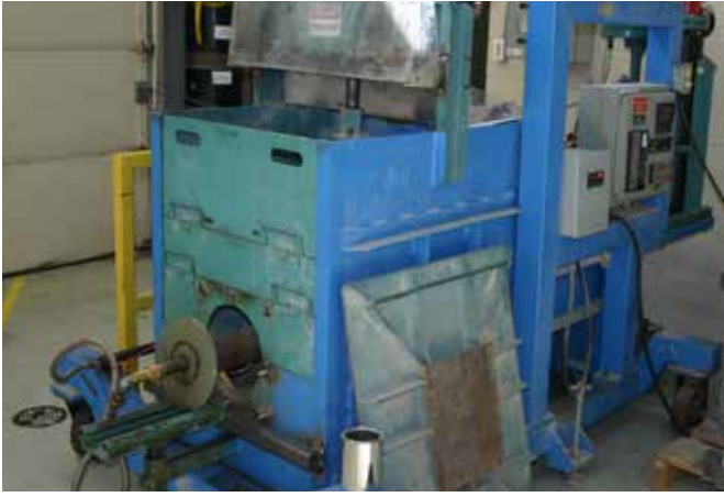
Figure 5. Soil stress testing in soil box.

ambient temperature and at an elevated temperature that is the same as the continuous operating temperature of the pipeline.